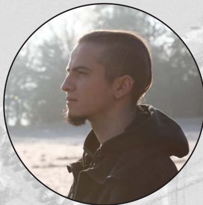
EMMANUEL MICHAUD Visuals & Performance (optional) www.emmanuelmichaud.com