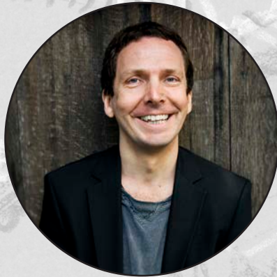
JESPER NORDIN Composition & Software www.jespernordin.com